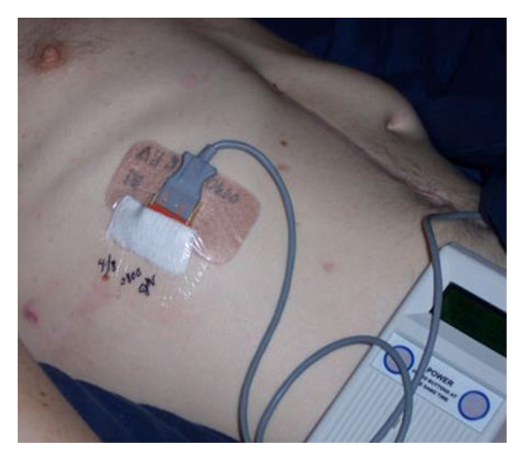
A DPS patient with stimulator, patient cable, and electrode connector in use.

The external components of the NeuRx<sup>®</sup> DPS include the External Pulse Generator (EPG) or stimulator, the patient cable, and the implanted diaphragmatic electrode wires which are connected to the patient cable via the electrode connector or "block". The electrode connector is attached to the chest wall using an adhesive connector holder.