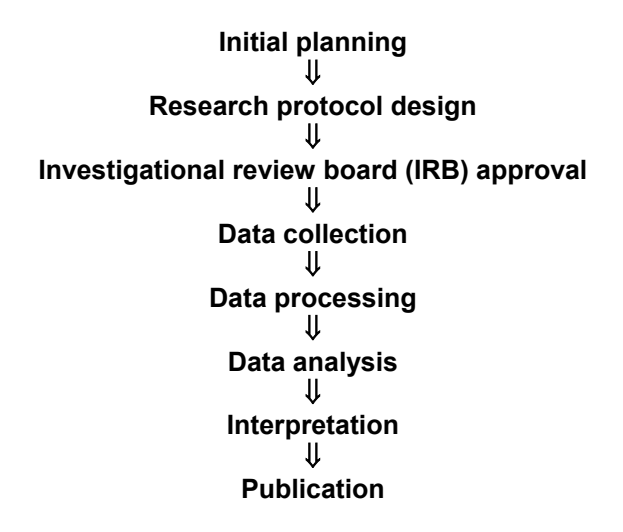
Figure 9-1: The research process (adapted from reference 1)

Before data collection ever begins, therefore, much of the work involved in medical research is already completed. Failure to exercise such attention to detail and planning may result in faults in study design that are subsequently propagated throughout the study and impact on each step of the research process. No amount of statistical manipulation can correct for errors and biases introduced by a poorly designed study.