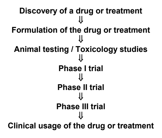
Figure 9-3: Clinical Trials

Experimental studies involve the administration of an intervention or treatment to two or more groups of patients with attention being directed to identifying the impact the intervention has on a particular outcome. Experimental studies, through demonstrating a response to therapy, may prove "causation". A clinical trial is an experimental study that involves a clinically applicable therapy. Clinical trials generally involve the comparison of an experimental drug or therapy against a control (standard therapy or placebo). The Food and Drug Administration categorizes these into Phase I , Phase II , and Phase III trials. A Phase I trial is the initial introduction of a drug or treatment to humans. It identifies any associated toxicity and may begin to determine dosing levels and efficacy. Phase I trials are small, usually involving only 10 to 20 patients. A Phase II trial demonstrates the effectiveness and safety of a drug or treatment at specific dosages. These closely monitored trials involve 100 to 200 patients. After demonstrating a treatment's efficacy, an expanded Phase III trial is performed to identify the specific indications and uses of the drug or treatment as well as more precise information on related side effects. Figure 9-3 outlines the progression of a typical clinical trial.